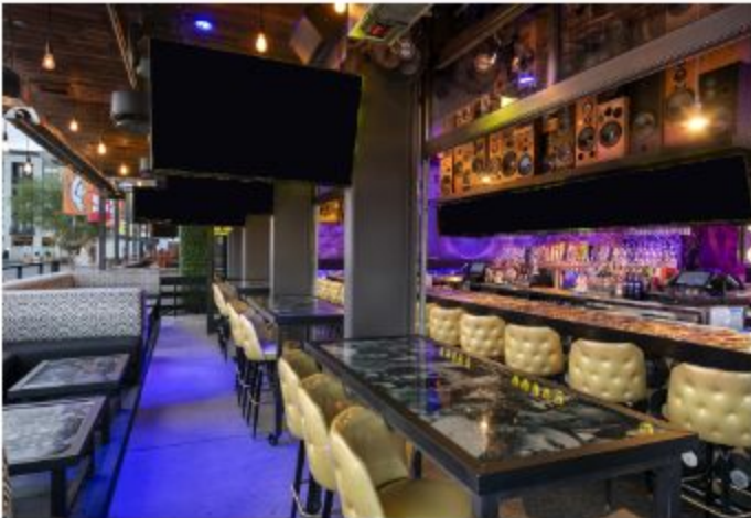
EAST PATIO w/ EAST BAR